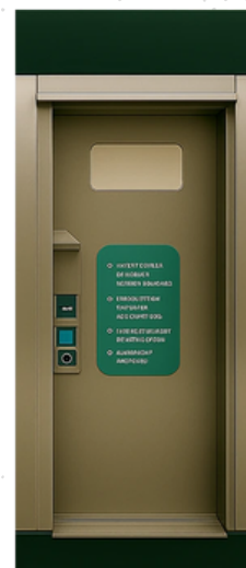
N1 - Single Unit