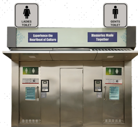
N2 - Double Unit