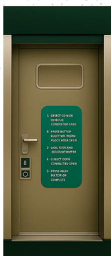
N1 - Single Unit